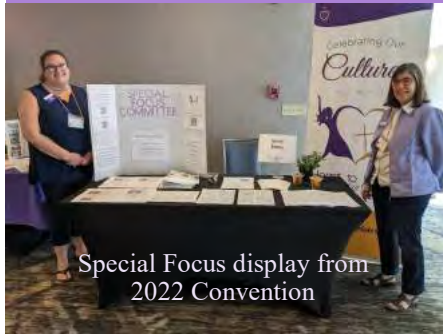
Special Focus display from 2022 Convention