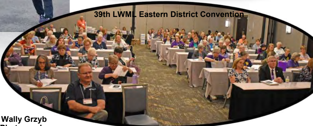
39th LWML Eastern District Convention