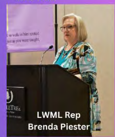
LWML Eastern District Convention * 2024, MARS, PA