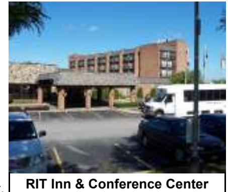
RIT Inn & Conference Center

as each part does its work" The convention committee selected the theme song titled "Bind us Together" as another focus on our working together in the planning of this event. This year the convention committee is a joint effort by two zones, the Genesee and Central NY North. This theme is especially appropriate as the two zones come together to meet, plan and work together to the glory of God. We have special entertainment planned for the Saturday evening banquet so we hope you are planning on attending.